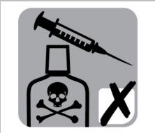
Hazardous and medical waste