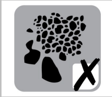
Dirt and rocks