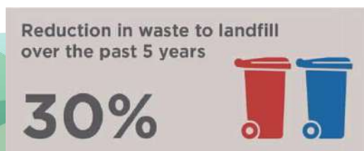
Kerbside waste statistics for 2019-2020 compared to the previous year.