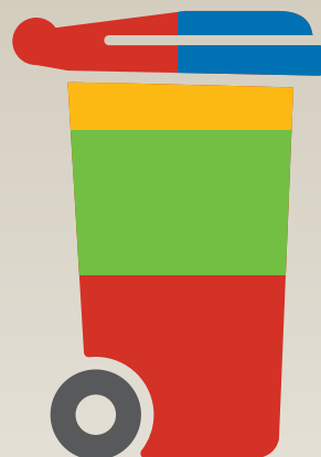
General Waste Bin